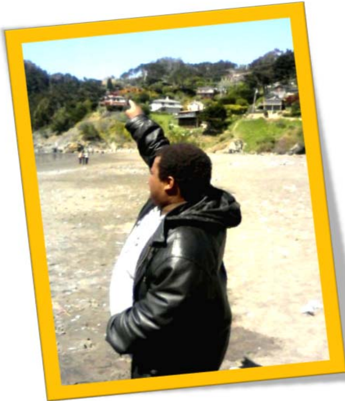
pointing at the overlook on Muir Beach in April 2009