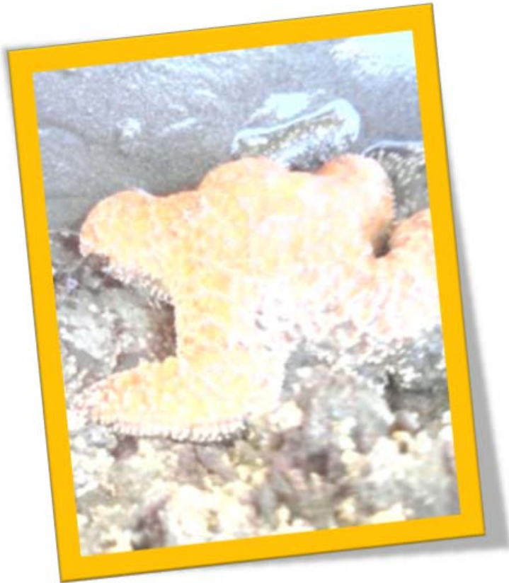
a starfish on central Muir Beach

The central part of Muir Beach is the part of the beach for sitting and wading in the water.