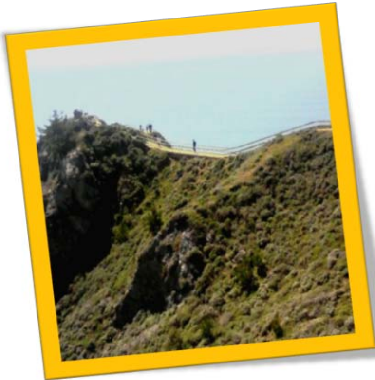
The Muir Beach Overlook Trail

after looking at some pictures in a book in the San Francisco Public Library