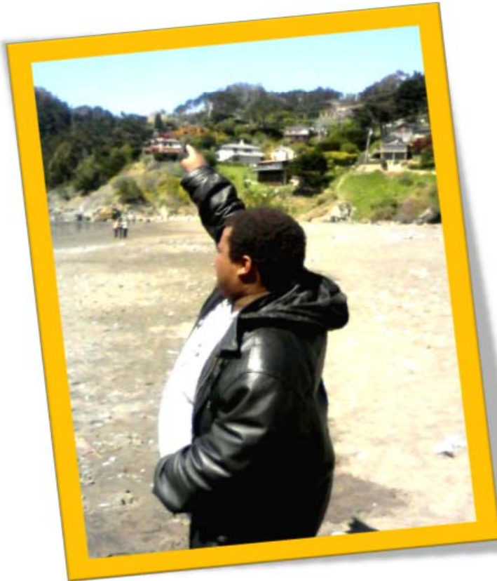
pointing at the overlook on Muir Beach in April 2009